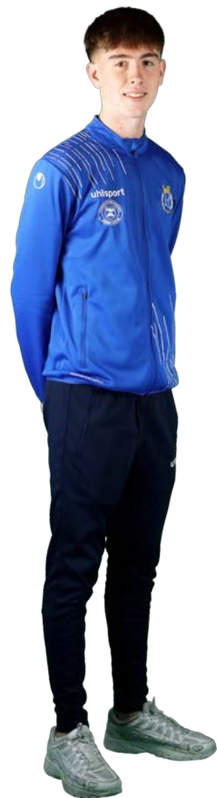
Dungannon Swifts' Scholarship Programme Uniform

Sixth Form students enrolled on the Dungannon Swifts' Scholarship Programme will obtain their uniform from the course facilitators.