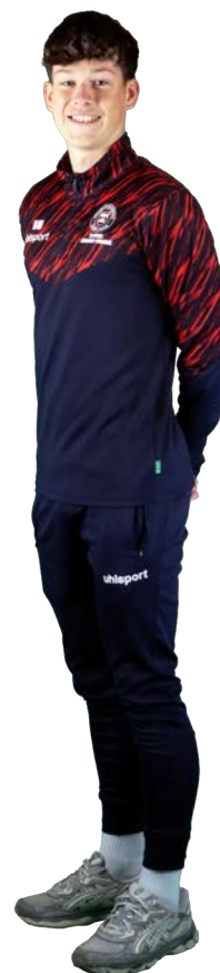
NI Football Scholarship Programme Uniform