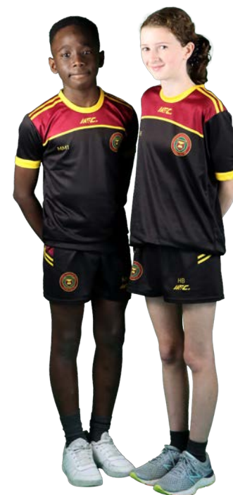
Compulsory PE kit (available online)