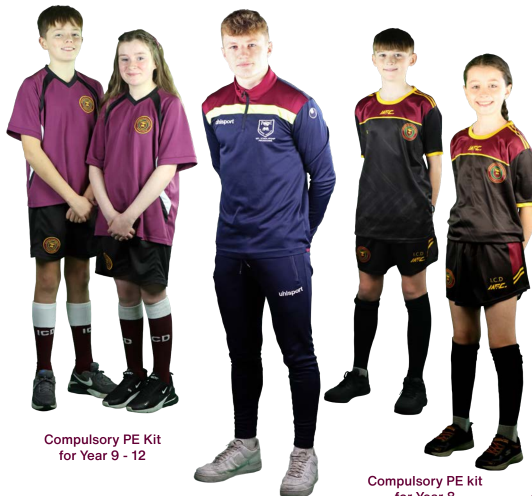
Compulsory PE Kit for Year 9 - 12