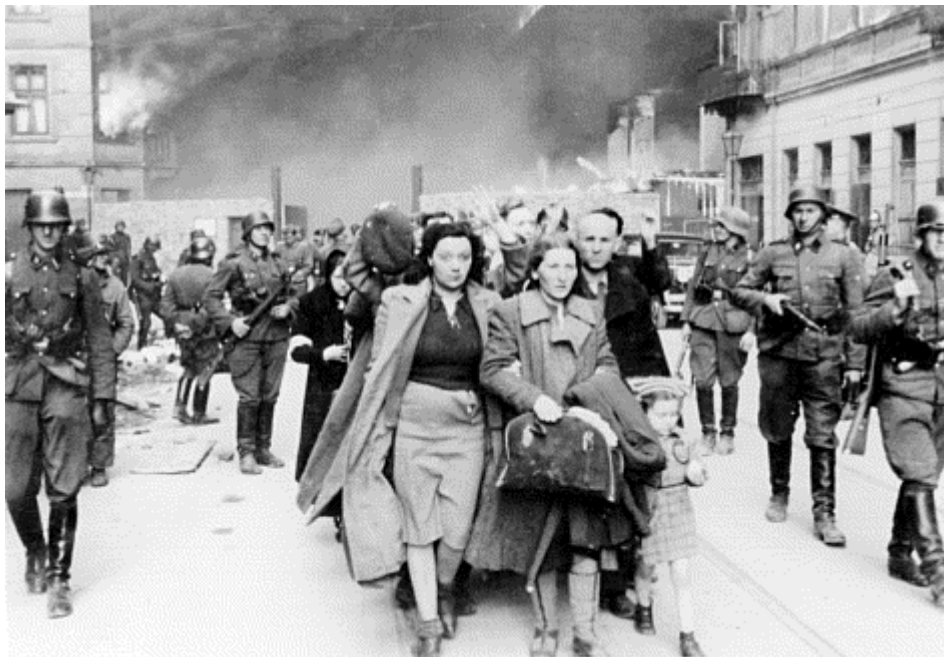
The Warsaw Ghetto