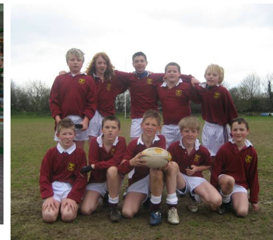
The Year 8 Rugby Team at ICD